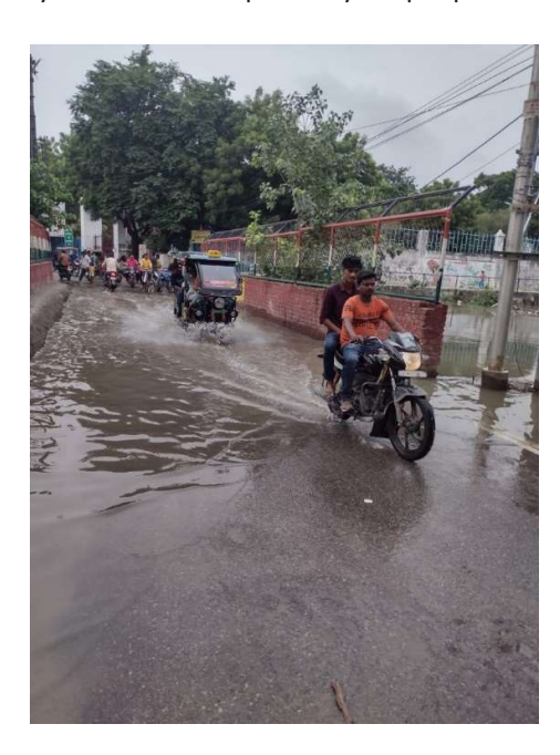
The Nagwa bridge was flooded.