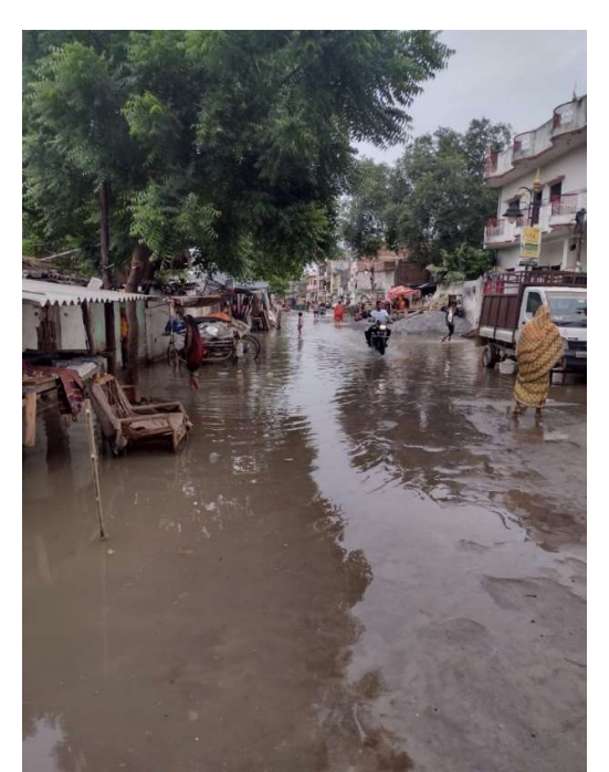
The road toward Gangotri Vihar

And from my home . . . my garden became a swimming pool! I'm hoping I won't lose too many of my plants this year. There are still about 3 feet of water inside my house. The water will take some time to abate, and then I will wait more days for my house to dry out a bit. Maybe after two weeks or so I will be able to move back home.