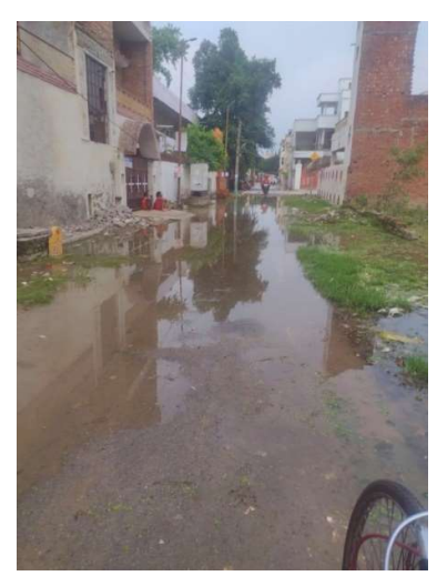
Water standing in front of our school. (The women in red are sitting in front of our school entrance.) The water later rose nearly to knee-height.