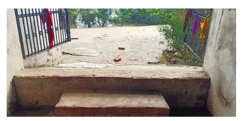
Before and after: the water came within a few vertical inches of entering our building. As of this morning, our back field is muddy, but visible.