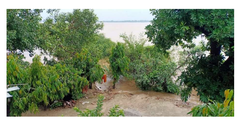
The same view: picture at left was taken on Aug 30. This morning there is just a bit of water covering the back corner of our playground.